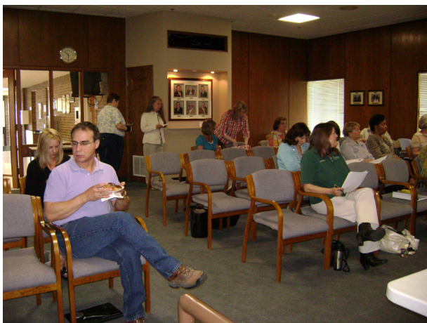
May MBPTA Meeting at the City of New Hope